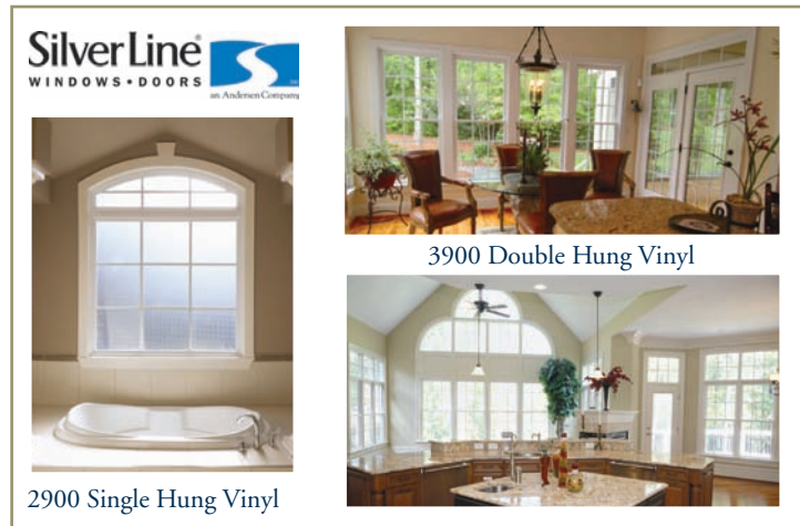
2900 Single Hung Vinyl

Installing or replacing windows & screens can be an arduous undertaking, so why do it yourself? At Barefoot & Company we alleviate any concerns you may have and provide the quality you deserve.